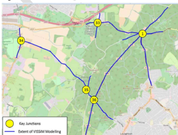
Figure 1: The modelled road links